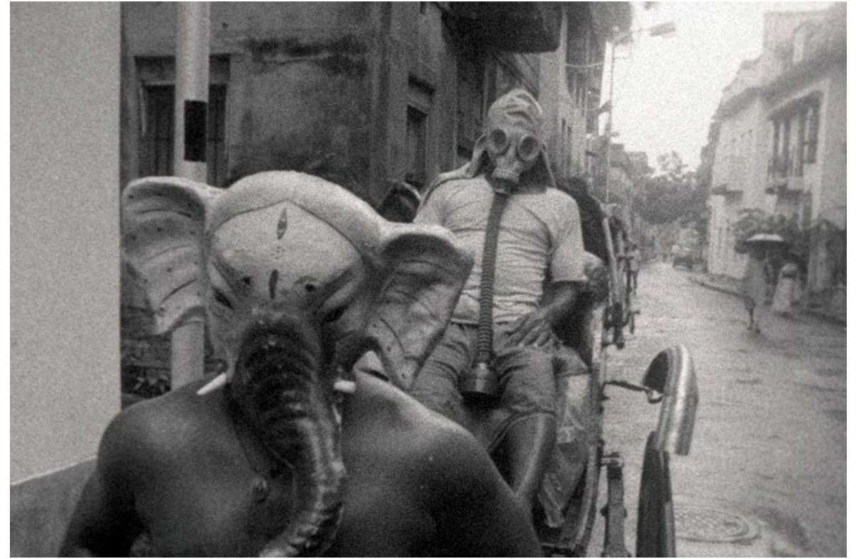
Untitled from the series Vakratunda Swaha Film still on archival paper 11 X 14.75 in Edition 5 + 2APs