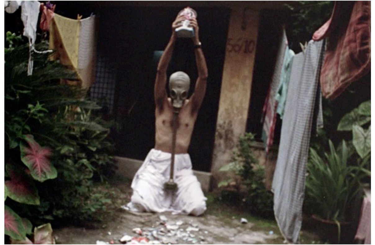
Untitled from the series Vakratunda Swaha Film still on archival paper 11 X 14.75 in Edition 5 + 2APs