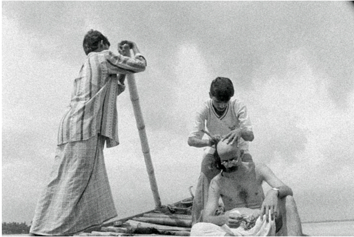
Untitled from the series Vakratunda Swaha Film still on archival paper 11 X 14.75 in Edition 5 + 2APs