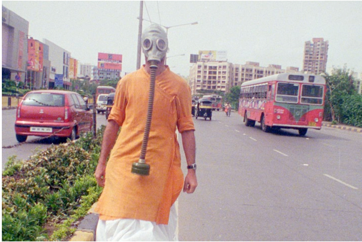
Untitled from the series Vakratunda Swaha Film still on archival paper 11 X 14.75 in Edition 5 + 2APs