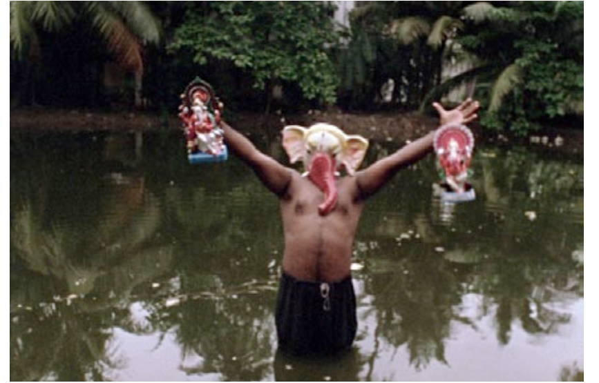
Untitled from the series Vakratunda Swaha Film still on archival paper Triptych (each 11 X 14.75 in) Edition 5 + 2APs